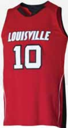
Shown: Men's miTeam adiZero™ Jersey pg 18

FORMOTION™ garments use pre-shaped 3D silhouettes that allow great freedom of movement while you exercise. Many features such as sculpted openings at collar, waistband, hem, arm, cuff and leg, combined with specific fabrics, constructions and ideal seam placement result in optimized fit and comfort.