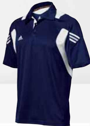
Shown: Men's Scorch Polo pg 94

CLIMACOOL® clothing moves heat and sweat away from your body through a mixture of heat and moisture management materials, ventilation channels and three dimensional fabrics which allow air to move closely to the skin.