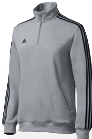
Shown: Men's Pindot Quarter Zip pg 100

CLIMAWARM™ is lightweight, breathable insulation that keeps you dry and comfortable in cold weather conditions by using densely woven synthetic fibers to trap warm air close to the skin. While these fibers are dense enough to trap air, they are spaced far enough apart to easily allow heat-sapping sweat to escape through evaporation.