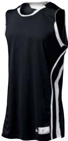
Shown: Men's Pro Team Jersey pg 10

Thin, soft and breathable fabric that pulls sweat away from your body, keeping you dry and comfortable during your workout.