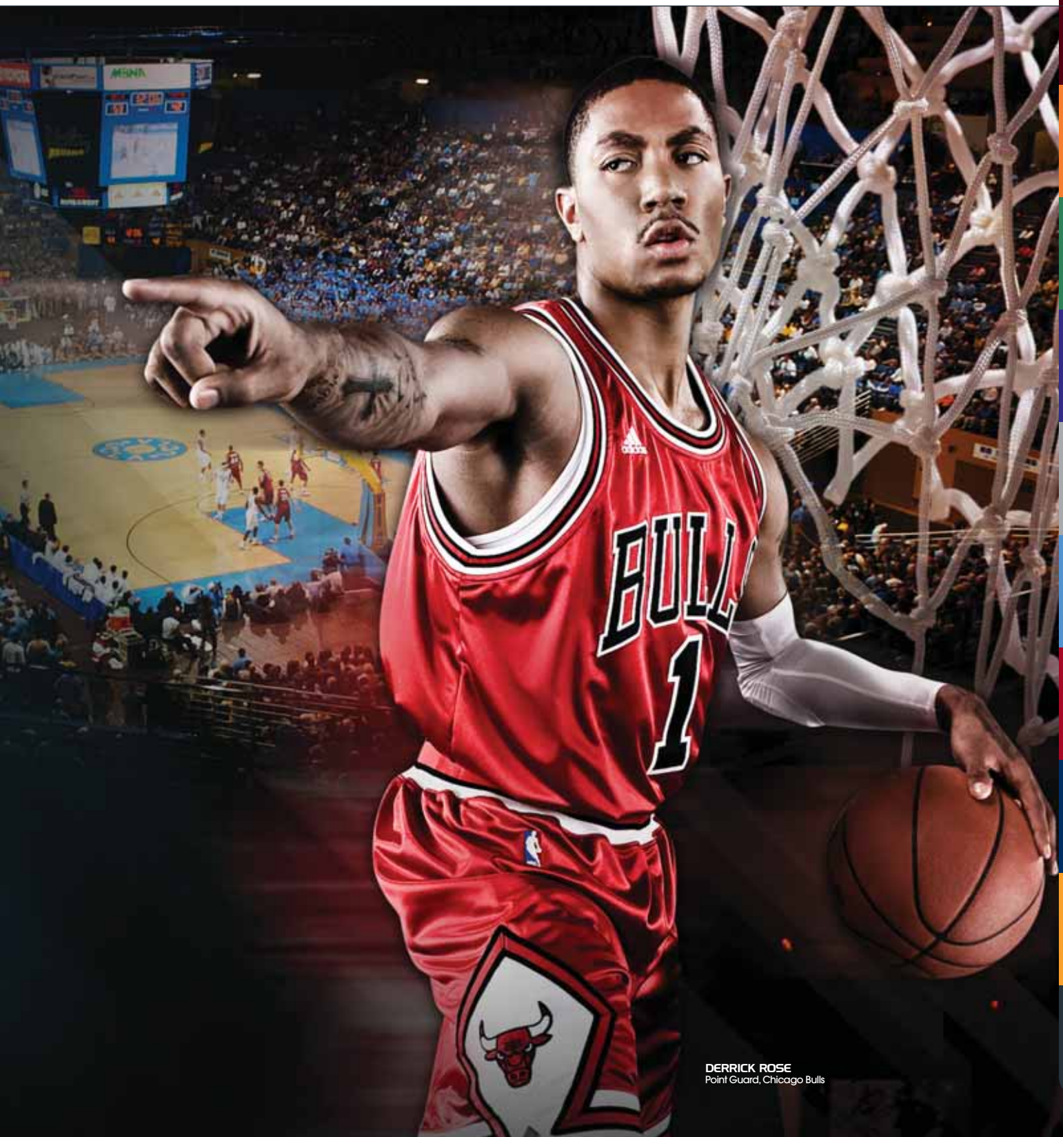
DERRICK ROSE Point Guard, Chicago Bulls