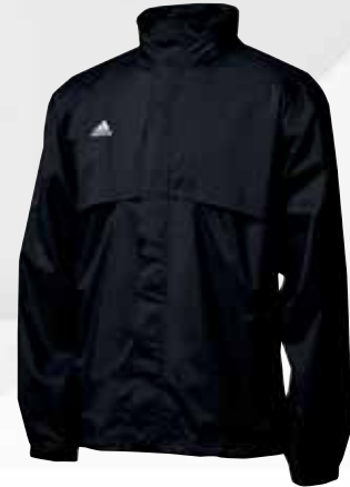
Shown: Men's Stadium Waterproof Jacket pg 102

Protects you in wind, rain or stormy weather conditions by acting as a barrier to the elements while allowing heat and sweat to escape through evaporation, maintaining optimum body temperature.